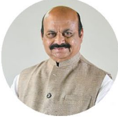
BASAVARAJ BOMMAI CHIEF MINISTER