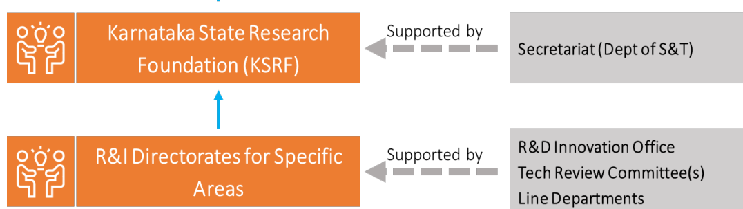
Figure 1: Administrative structure for R&D governance

Figure 1 provides a representation of the governance structure of the R&D.